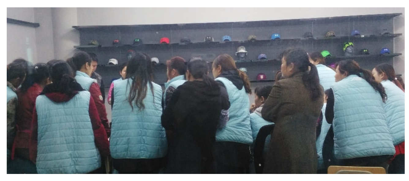
Exhibit1: Angry workers at Jiangsu Asian Sourcing

In 2015 there have been complaints about harassment. Allegedly workers were forced to work in short sleeved t-shirts when the workshops were freezing cold. [lianshui_13]