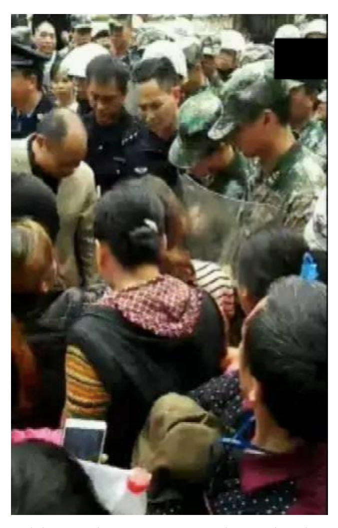
Exhibit 3: Violent protests at Wenhua in Shenzhen

Earlier, workers have evaluated Shenzhen-based Wenhua as a comparatively bad work place. Besides low wages and authoritarian management it was stated that living conditions at the dorms are substandard as there are only commonly shared showers and charging (mobile phone) batteries was not allowed [pinghuwenhua_3].