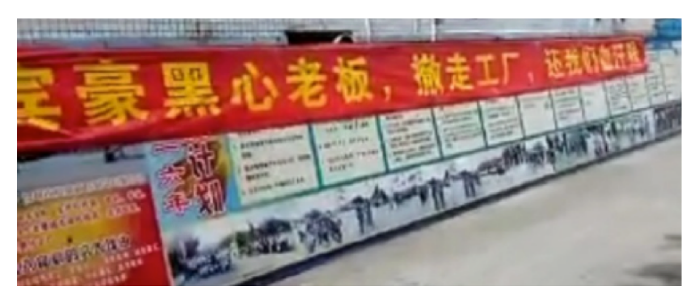
Exhibit 2: Protest banner at Binhao Bag factory

A worker made the following allegations in 2017: "[...] every day every night we have to work overtime, but do not get paid for that. They keep two months wages as a deposit. They do not allow you to quit and if you leave anyway two months of salary are gone. Apart from that you do not get your contract when you start working there. The leaders are cheating us and do not take responsibility. When something happens they will ask their subordinates to solve the issue."